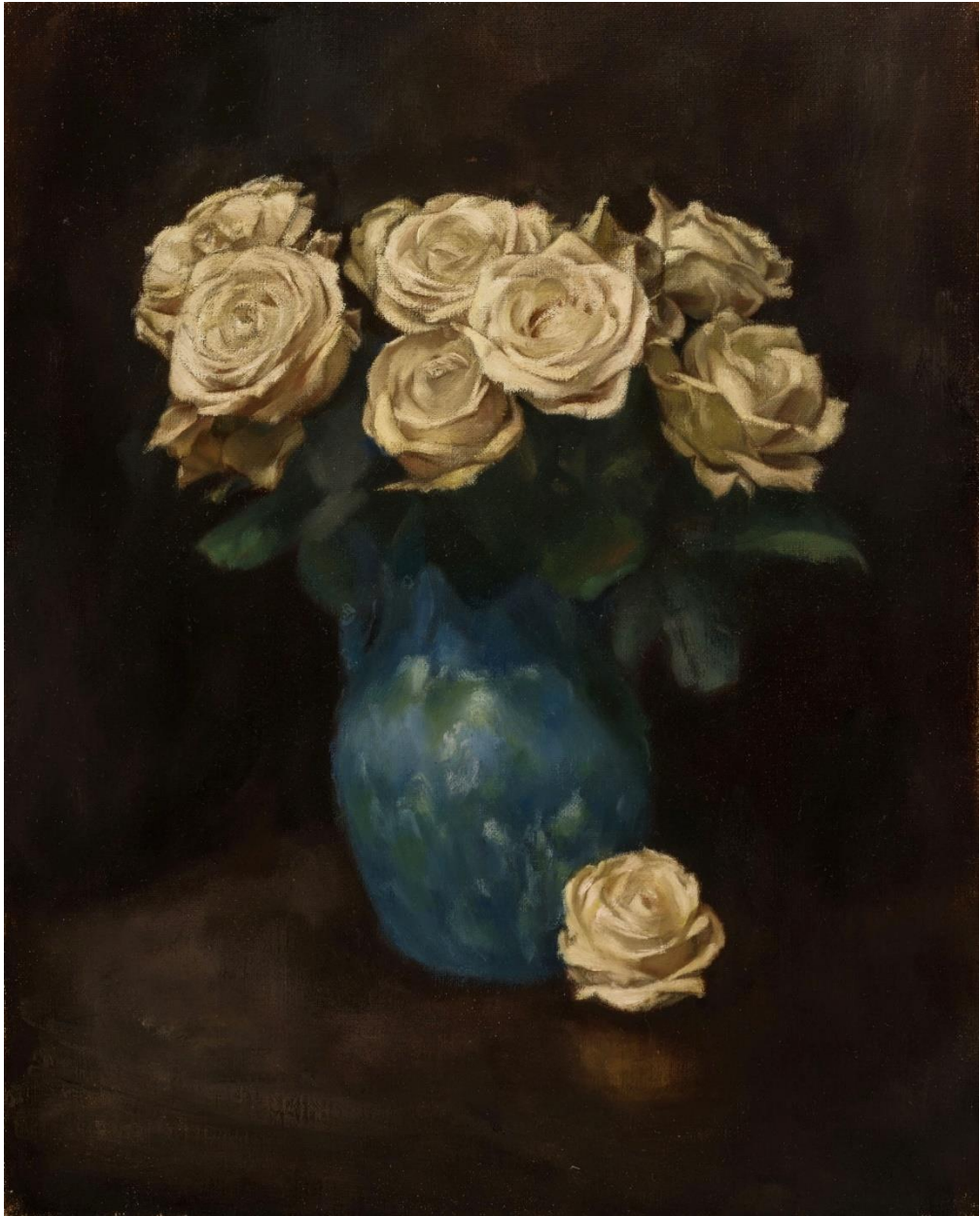
White roses in vase Nicholas Benedict Robinson