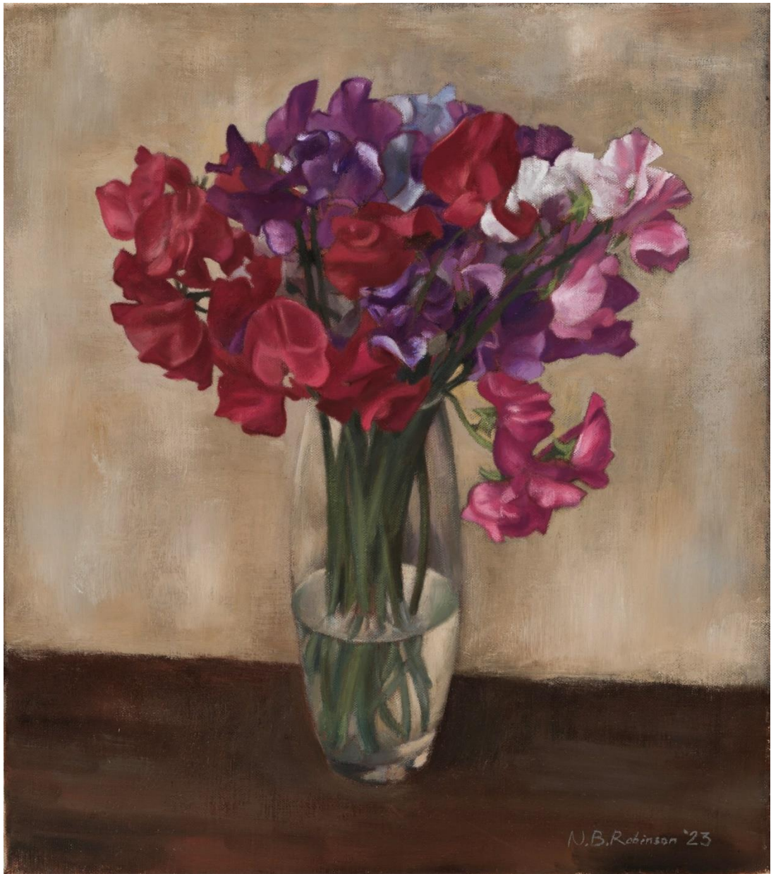
Sweet peas in glass vase Nicholas Benedict Robinson

Art Description 46cm x 40cm Oil on canvas Framed NRSMB104