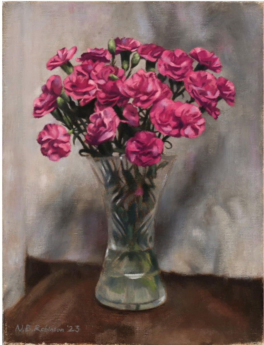
Pink Dianthus in glass vase Nicholas Benedict Robinson

Art Description 40cm x 30cm Oil on canvas Framed NRSMB001