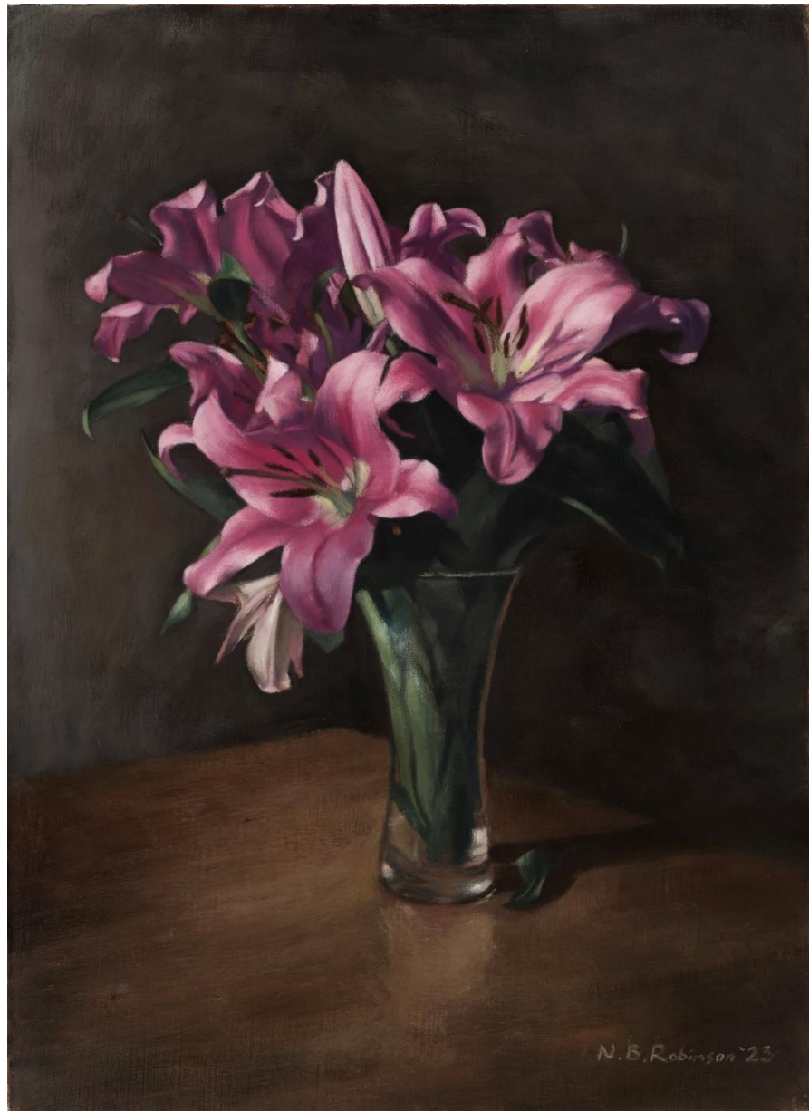
Pink Lilies in glass vase Nicholas Benedict Robinson

Art Description 56cm x 40cm Oil on canvas Framed NRSMB106