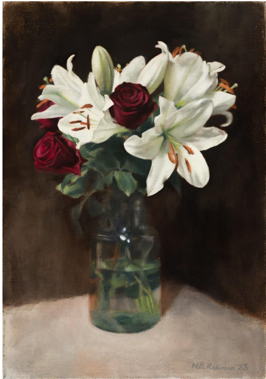
White Lilies and red roses in glass vase Nicholas Benedict Robinson

Art Description 51cm x 35cm Oil on canvas Framed NRSMB105